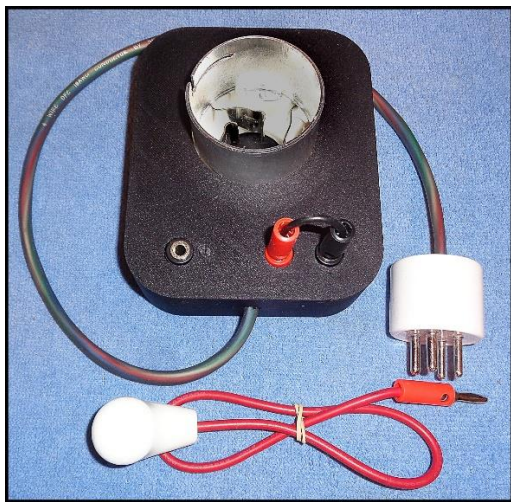
Jumbo (4-pin) to UX-4 4-pin Socket (845 to 300B)