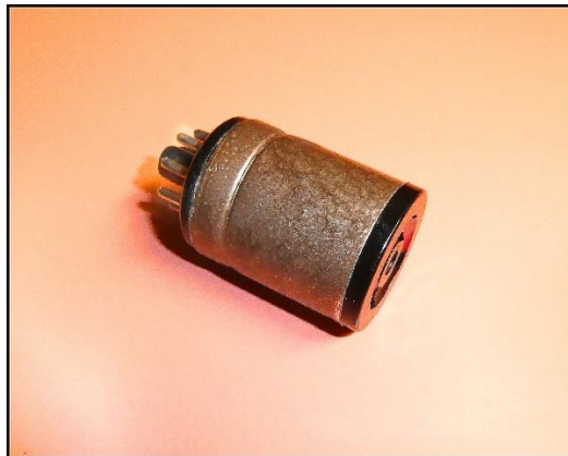
UX-4 (4-pin) to 8-pin Octal socket (300B 4-pin to 8-pin octal)