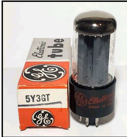
5Y3 Full-Wave Vacuum Rectifier