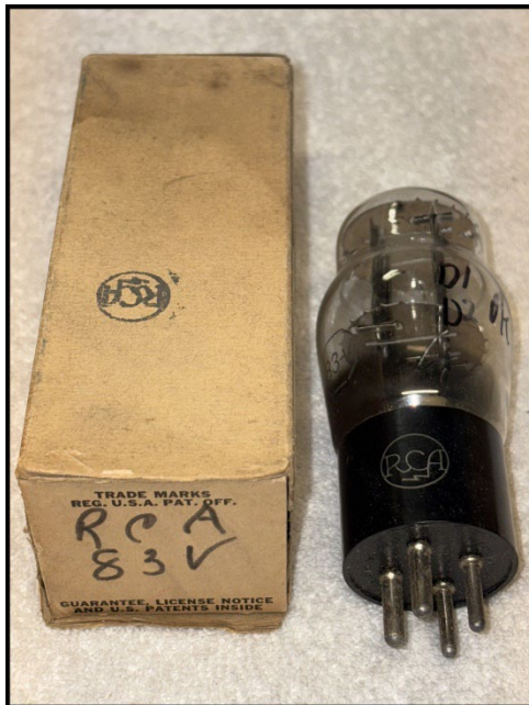
83 Full-Wave Mercury-Vapor Rectifier/ voltage regulator